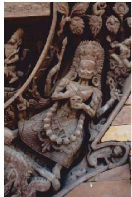
Fig.3 : Camuṅḍā bracket, Nārāyaṇa temple Bhaktapur, 2 nd half of 17 th century CE, wood Kāthmandu valley.

purvue d'une tête de laie (IC I, p.76)." [Translation AG: It is almost certain that the image of Umā was placed in the southwest tower, since its panels are decorated with female figures one of whom is equipped with a saw head]. This argument, however, seems to be misleading, since, in this case, the enumeration of the images would start in the southeast (Śiva shrine), would jump either to the northwest shrine or to the northeast shrine (Viṣṇu), would then proceed to the image of Umā in the southwest (Umā shrine), and would end with the second Śiva shrine in the northwest or northeast. Such an enumeration, however, is not probable. In general, we should expect a clockwise continuation ( pradakṣiṇavat ), here starting from the southeast shrine. In this case the female deities on the wall of