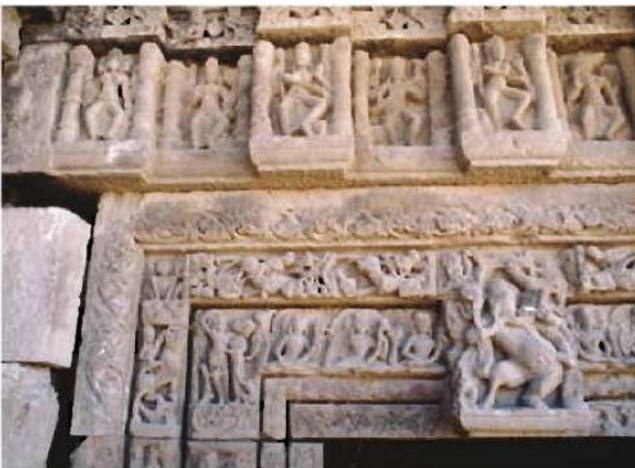
Fig.7:Saptamātṛkās, detail from left:Brāhmānī,Vaiṣṇavī Māheśvarī,Kaumārī,Śiva,Vārāhī,Tripletemple,Śivashrine Āṃvān,10 th centuryCE,sandstone,Rajasthan.