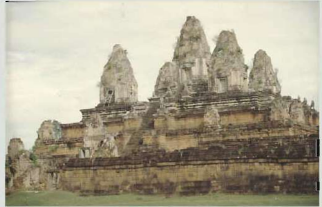
Fig.1 : Pre Rup temple from south, Angkor, 961 CE sandstone.

The temple is crowned by a square platform carrying five temples that are placed according to the Indian pañcāyatana scheme, viz. one temple at the centre and four side shrines on the corners of the platform 3 (Fig.2a). In contrast to the Indian arrangement, where the rear two side shrines are opened to the same direction as the main temple and the two front shrines