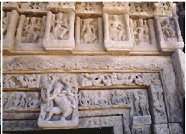
Fig.8 : Ibidem, Saptamātṛkās, detail from left: Kaumārī Śiva, Vārāhī, Indrānī, Cāmuṇḍā, Gaṇeśa.