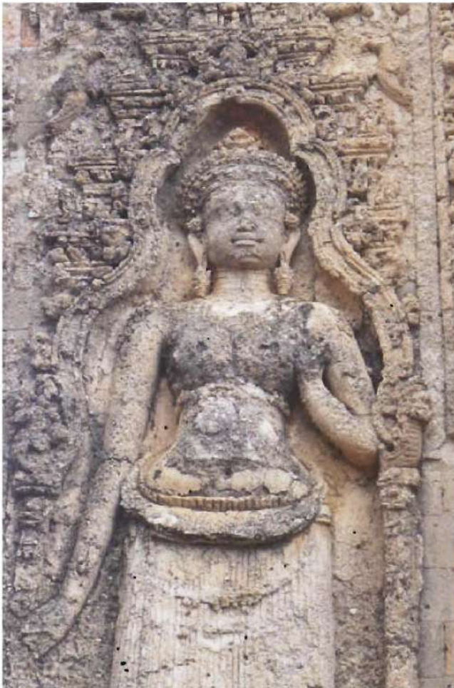
Fig.9: Nārāyaṇī(?), Pre Rup, north side, east wing of southwest shrine, stucco.

To date not a single scholar identified the Pre Rup females with the aṣṭa-mātrkās , 14 although this identification is inevitable in the light of the remnants of iconographical features and both textual and pictorial parallels from India and Nepal. The female goddess did not play a major role in Khmer religiosity, in truth the Indian Śāktism did not exist in Angkor, 15 Durgā functions as a side goddess in Śaiva contexts, she never appears as the cult figure of a main shrine. All the more, any certain indication of a worship of female deities can be helpful to add to our knowledge about the role of the mātrkās in Khmer Hinduism. Here we have sure indications of a set of (eight) Mātrkās as part of a Vaiṣṇava side shrine that formed, for his part, the component of a Śaiva complex. There is no final proof that the eighth goddess (Fig.9) is indeed Nārāyaṇī, but her pictorial appearance would perfectly correspond to her importance expressed in stanza 5 of the Pre Rup inscription.