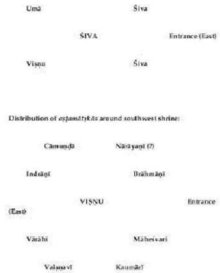
Fig.2b : Pre Rup temple, distribution of images A.J. Gall

Sequence of cult images according to Pre Rup inscription proceeding from the southeast shrine pradakṣiṇavat to the northeast shrine: (SE) Rajendravameśvara (Śiva), (SW) Rajendravivāruḥa (Viṣṇu), (NW) Girija (Umā), (NE) Rajendravameśvara (Śiva)