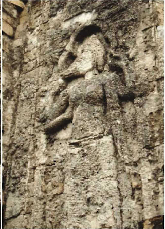
Fig.6: Pre Rup, Vārāhī, west side, south wing of southeast shrine, stucco.