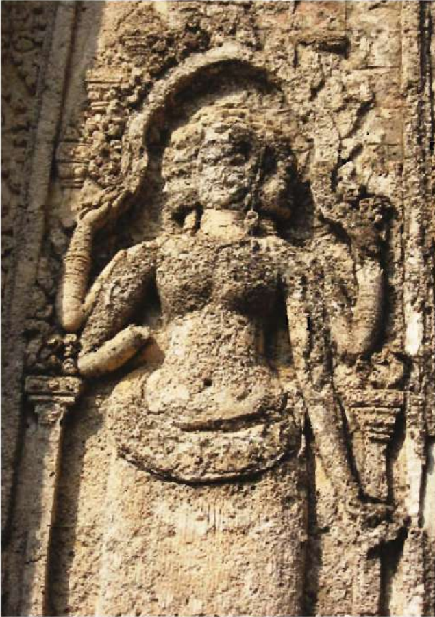
Fig.5 : Pre Rup, Brāhmānī, detail.