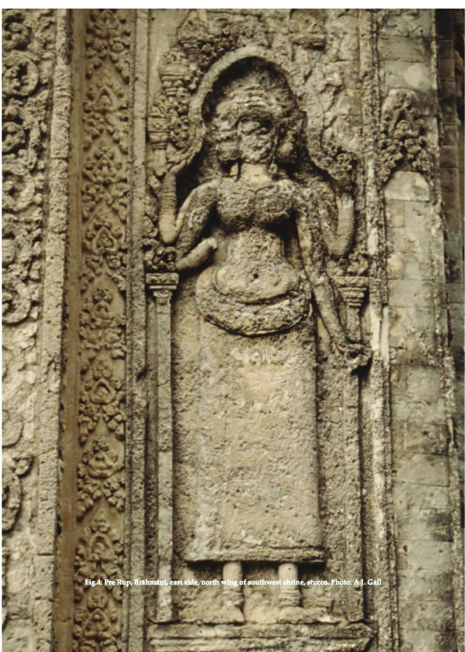
Fig.4: Pre Rup, Brāhmāṇī, east side, north wing of southwest shrine, stucco.