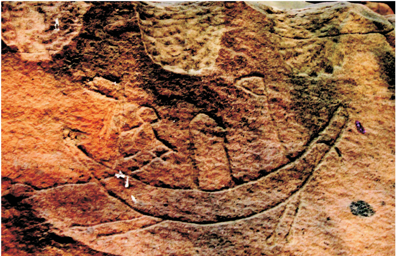
Engraving on sandstone depicting the ancient mode of transportation of stone blocks by boat, Chunar