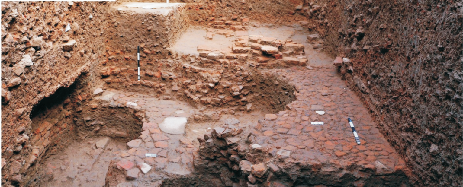
Excavated area, Saraswati Udyan