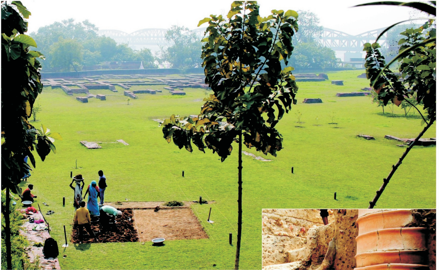
Beginning of Excavation at Rajghat, Varanasi