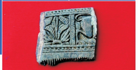
Some Findings of Excavation