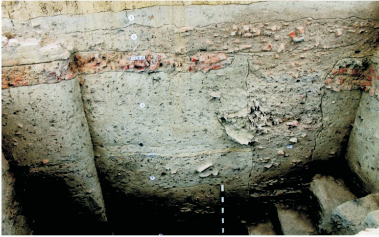
Various Levels in a Trench