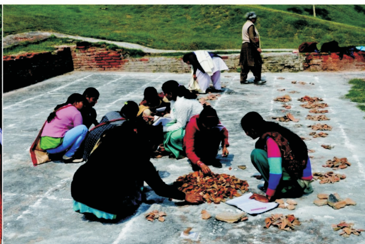
Practical Training at the Site