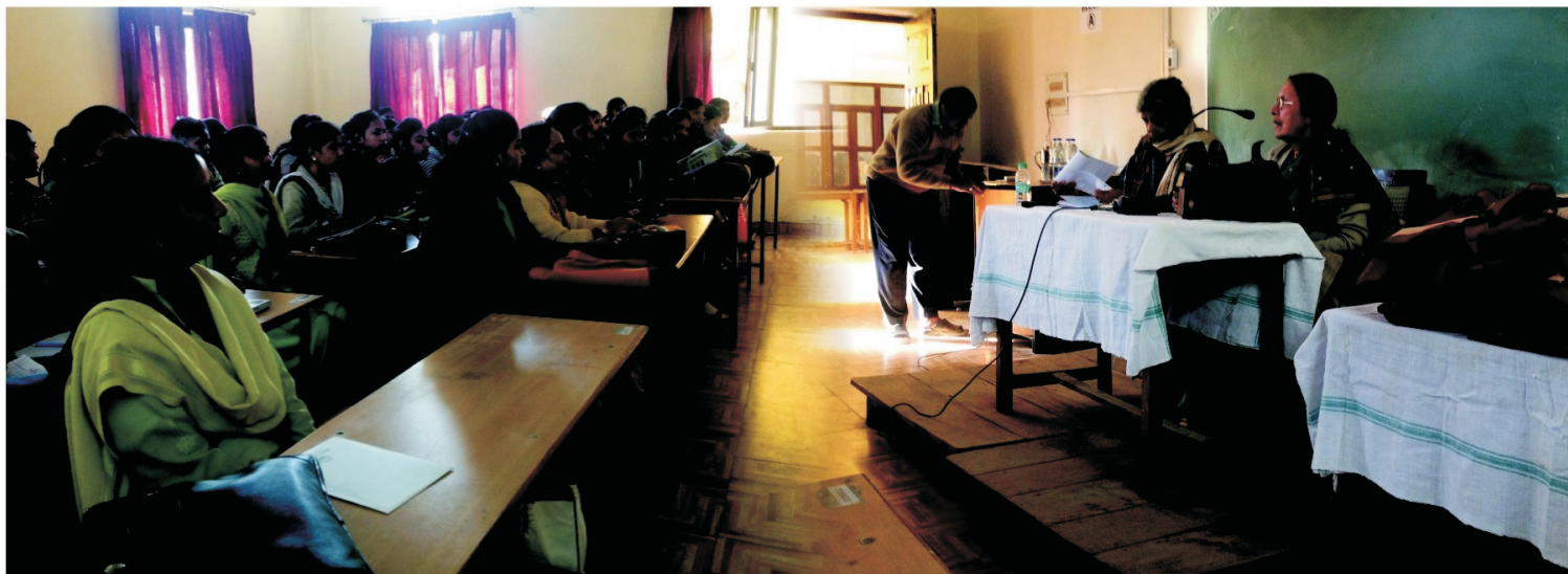
Theory Class in Progress