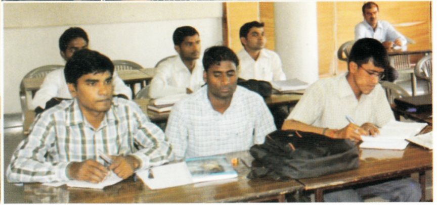
Theory & Practical Classes