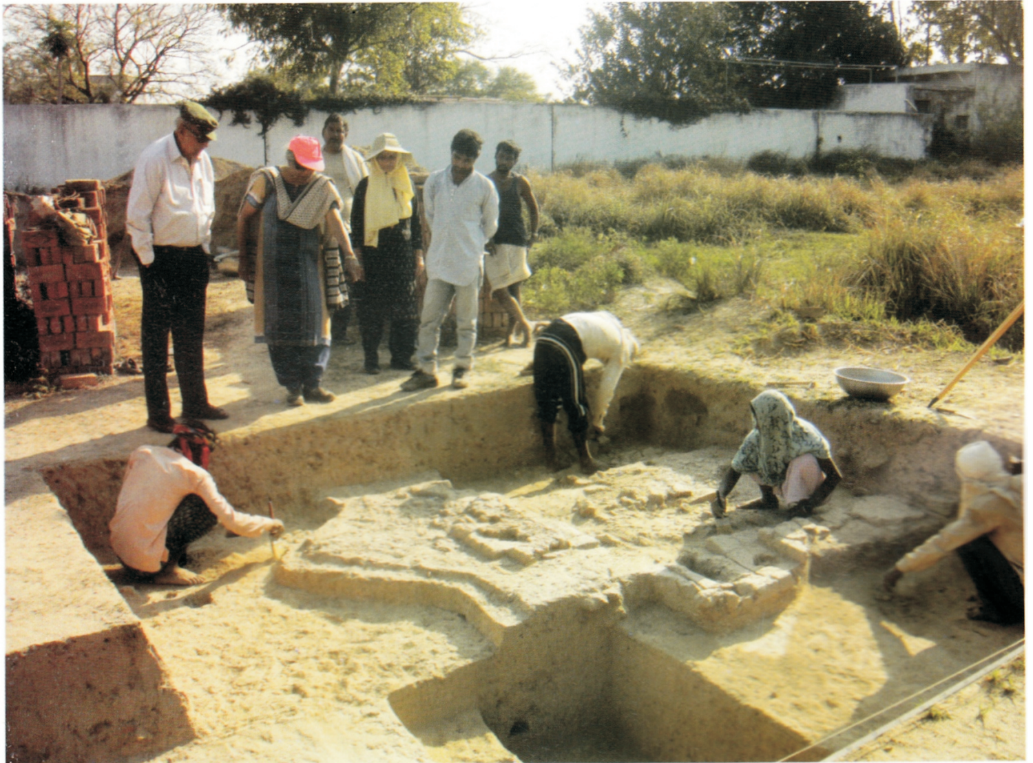
Excavation at Shooltankeshwar